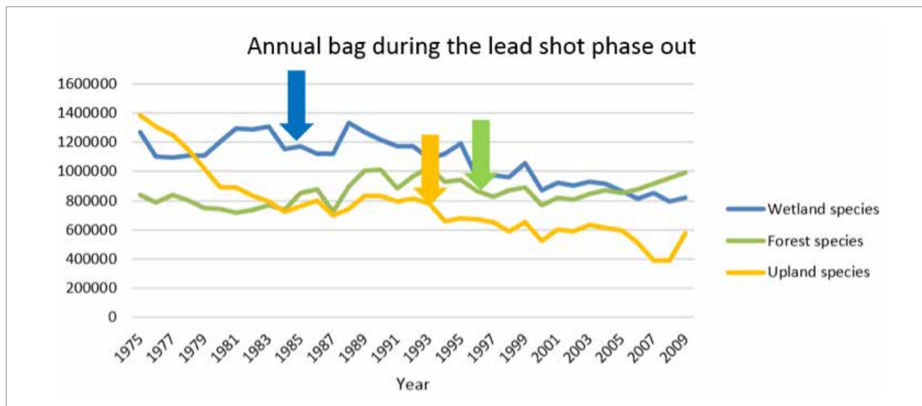
Figure 2: Annual bag of three groups of quarry species during the period of phase out of lead shot for hunting in the three habitats: wetlands, uplands and forests. Arrows indicate the time of regulation of lead shot in the particular habitat.

Data for species hunted with shotguns in the period 1975 to 2009 are shown in Figure 2.