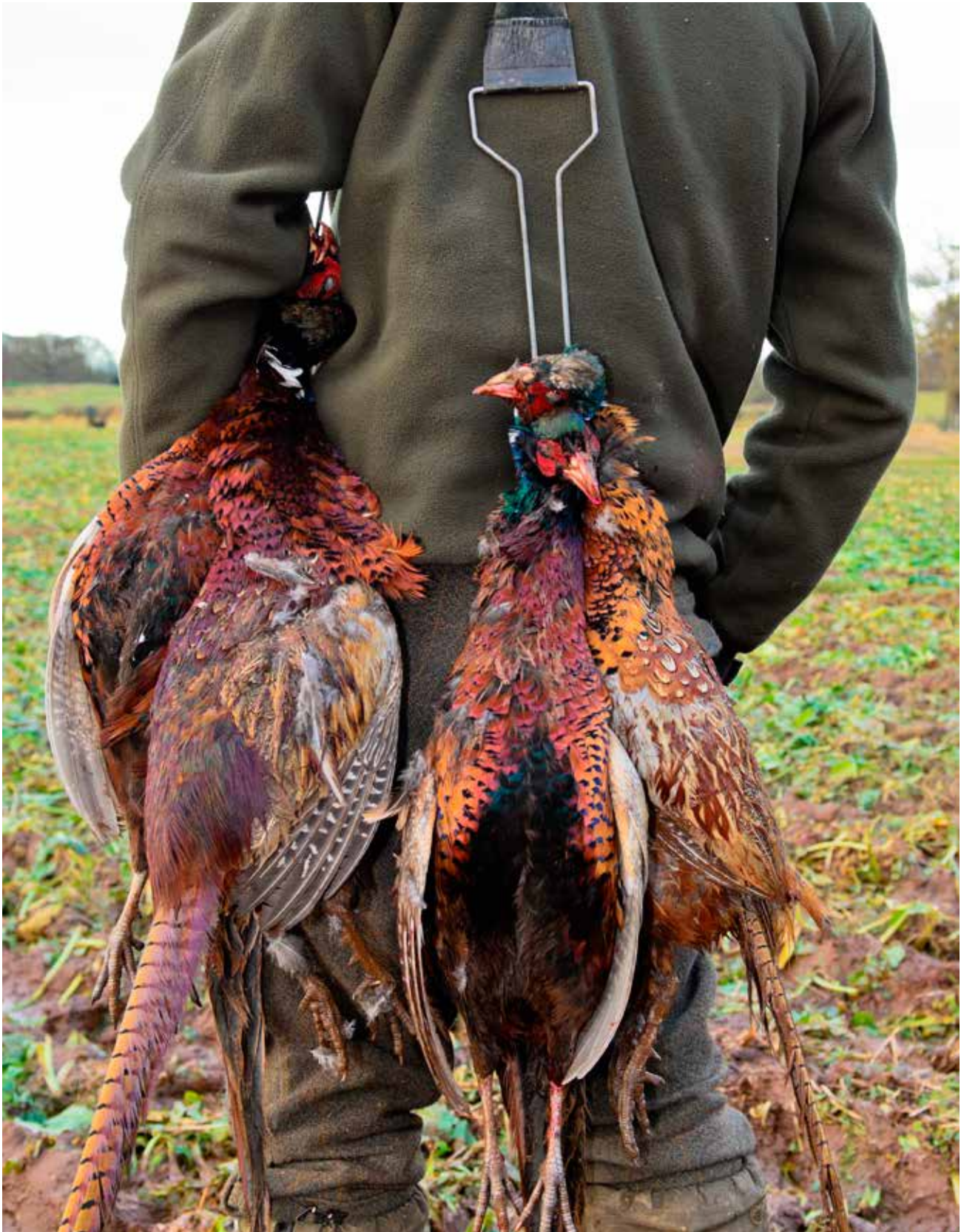
Pheasant shooting is popular in the UK and remains popular in Denmark 20 years after the transition to non-toxic shot.